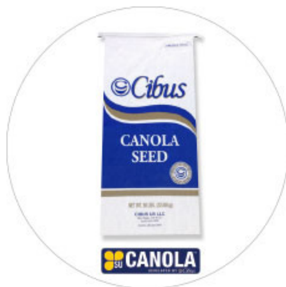
Figure 2: Sulphonyl-Urea herbicide tolerant canola 5715 seed packaging.

At least five genome edited crop plants have been produced, using Zinc Finger Nuclease, TALENS and CRISPR/Cas 9 nuclease technologies. USDA determined that Dow AgroScience's ZFN-12 phytate reduced maize was not a regulated article, being produced by ZFN induced partial deletions of the IPK 1 gene (55). TALEN has been used to simultaneously edit three homeoalleles in hexaploid bread wheat for broad spectrum resistance to powdery mildew (56), whilst Calyxt's mildew resistant 'MLO-KO' wheat, produced using TALEN has been determined to be outwith USDA oversight (57). CRISPR/